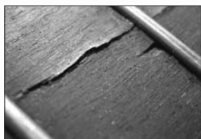
Frett board cracks